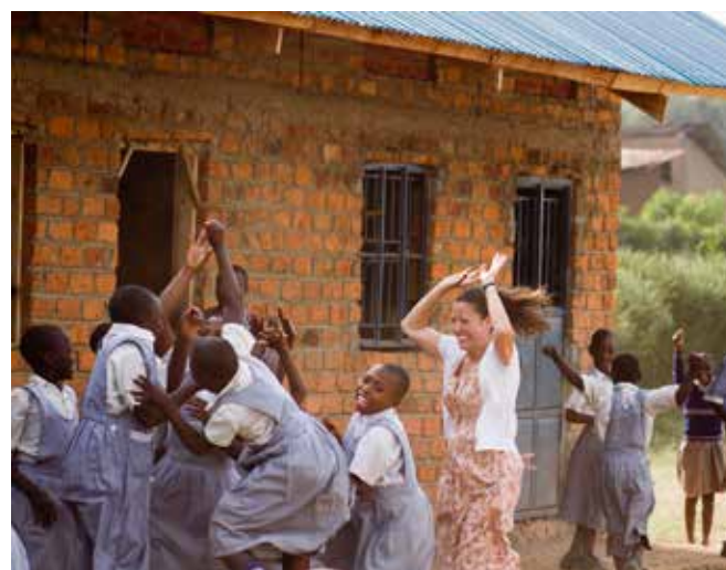
Pupils of Rwentobo World Shine Ministries Nursery and Primary School having fun with one of their sponsors

Me and you; we must remember that "at WSM we are a powerful creator of opportunities for Children's pride in kingdom of God, and springboard to their future, where one day historians will reflect upon the formation of WSM as a moment when Children stood tall and resolutely turned the tide on centuries of Africa's Spiritual backwardness, poverty and conflict.