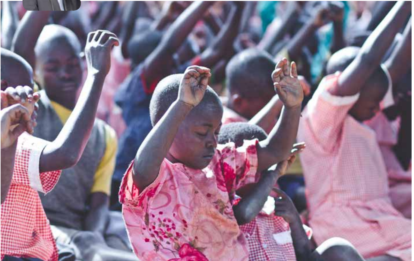
Pupils of Rwentobo World Shine Ministries Nursery and Primary School during a worship session

Mathew 19:14: "Let the children alone, and do not hinder them from coming to Me; for the kingdom of heaven belongs to such as these." If we are to have a healthy future, it is essential that we have a viable children's ministry, and that's why World Shine Ministries has "The World Shine Children's Ministry" . Children are a blessing from the Lord, and are loved by God himself (Mathew 19:14 "Let the children alone, and do not hinder them from coming to Me; for the kingdom of heaven belongs to such as these." )